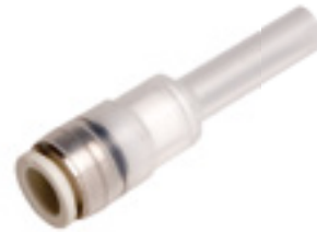
71.070 and 71.071: Plug-in pipe ( \varnothing d1 ) fits in \varnothing 4 mm / \varnothing 6 mm tubing connections